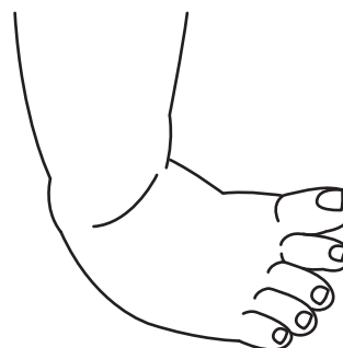
Figure 1. Positional talipes (equino-varus)