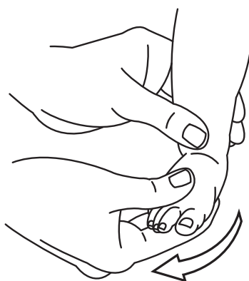
Exercise 1. Gently move baby's foot outwards.