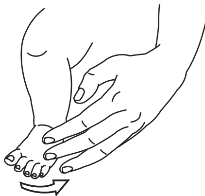
Exercise 2. Gently stroke the outside and front of baby's foot and lower leg.