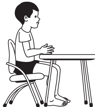
Figure 2. Correct position when sitting