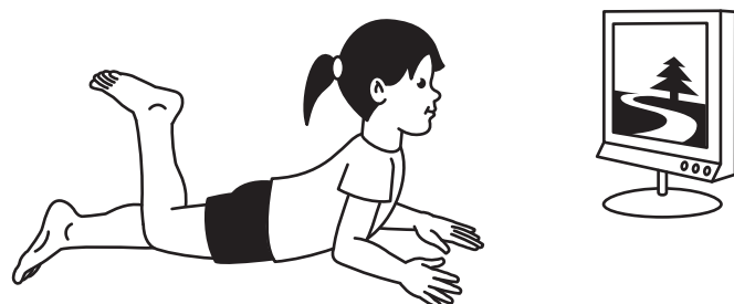
Figure 4. Lie on the tummy and stretch the back