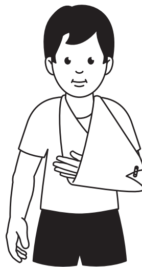
Figure 2. An arm sling should be used for comfort for two to three weeks